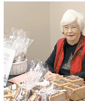
The Sandel Center's first holiday boutique was a hit! There were over 15 vendors with items for everyone on your list. Be on the lookout for a spring fair in early May featuring gifts for Mom and the garden.