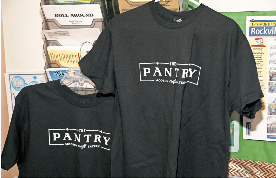
The REC would like to extend a special thank you to the Pantry Diner for donating their delicious pancake batter to our Breakfast with Santa event that took place in December. Over 900 people enjoyed the pancakes!! Thank you for your generosity.